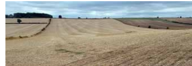
View southwards across Asthall oxbow towards the A40 from 600m SW of Asthall village, east of Burford.

As well as the geological processes (weathering, erosion, and deposition) which shaped the landforms, the scenery that we see today has been heavily influenced by the activities of man. The Holocene saw the re-colonisation of the Cotswolds by Mesolithic man as the climate improved after the inhospitable Last Glacial Maximum (i.e. 15,000 years before present). Actual landscape evidence survives of over 6,000 years of human occupation from Neolithic times (long barrows, e.g. Belas Knapp), through the Bronze Age (stone circles, e.g. Rollright Stones), Iron Age (hill forts, e.g. Cleeve Cloud) and Roman times (towns, villas, and roads, e.g. Cirencester, Chedworth, and the Fosse Way, respectively).