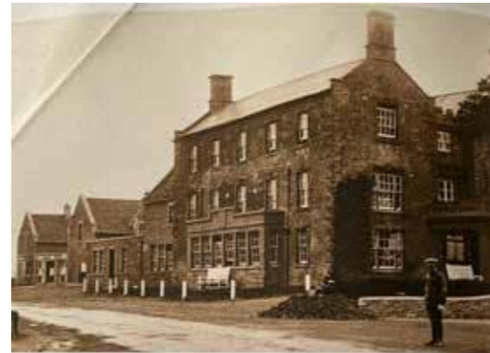
The Prince of Burford c. 1940

The hotel now known as The Prince of Burford presumably commemorates Charles Beauclerk (1607- 1726), an illegitimate son of King Charles II by his mistress Nell Gwyn. He was created Earl of Burford in 1676 and Duke of St Albans in 1684, titles which survive to this day. However, until a very few years ago, this hotel was called The Cotswold Gateway, and before that The Bird in Hand. On the other hand, there was a possible connection between the earl and The George in the High Street (a medieval inn presumably named after the saint). There are several legends about this; and some will even tell you that the boy was conceived in The George.